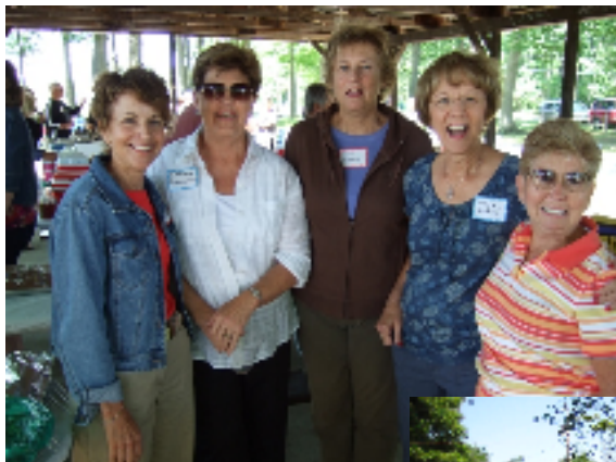
Newcomers having fun at the Ranch Rudolf Roundup and at the Annual Newcomers Picnic