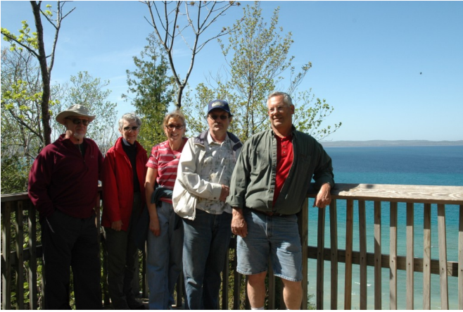
Newcomers at Whaleback Natural Area May 1, 2010.